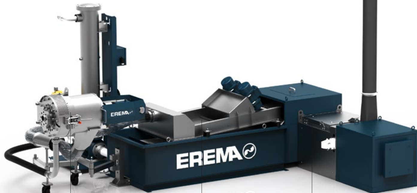
HG 154 D with Direct Drive technology

The proven EREMA hot die face pelletising systems have undergone another stage of development. The focus has always been on straightforward handling and easy maintenance. The new HG 154 D, HG 244 D and HG 344 D systems set higher standards in terms of functional reliability, straightforward operation and versatility.